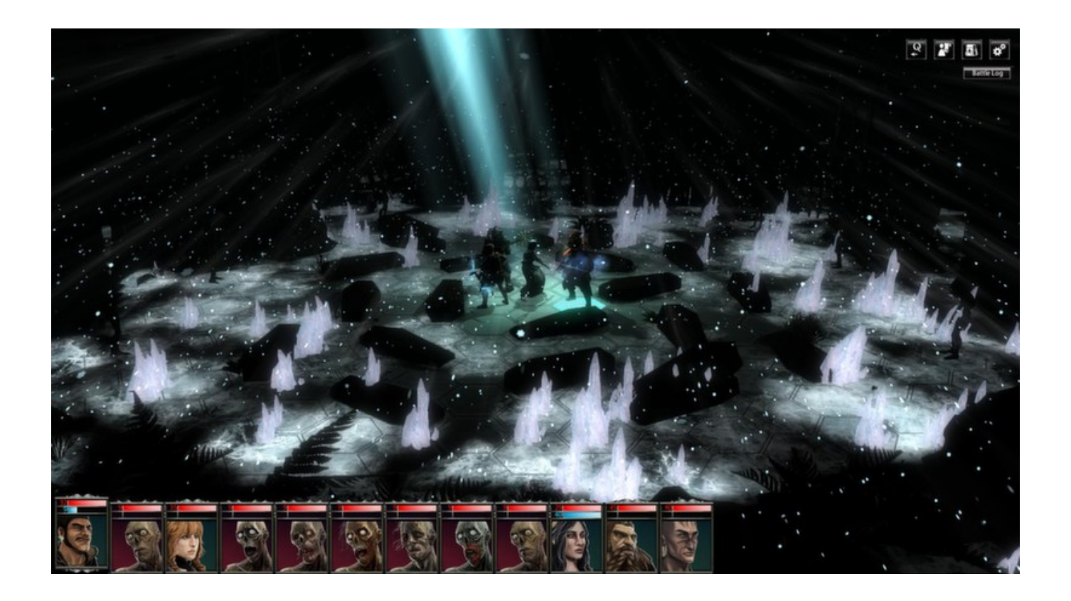
Tales Of Escape - Illusion (VR) Ativador Download [serial Number]

Download ->>> <a href="http://bit.ly/2SUULTz">http://bit.ly/2SUULTz</a>